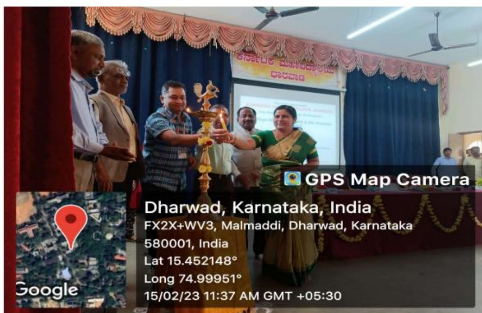
Inauguration of two day workshop for PG students