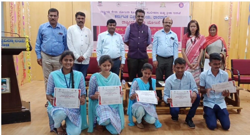
Certificates received by the participants

vi) State Level Seminar: State Level Seminar conducted on 19-08-2022 on the View of Azadi Ka Amrut Mahostava conducted by Karnatak Science College, Dharwad